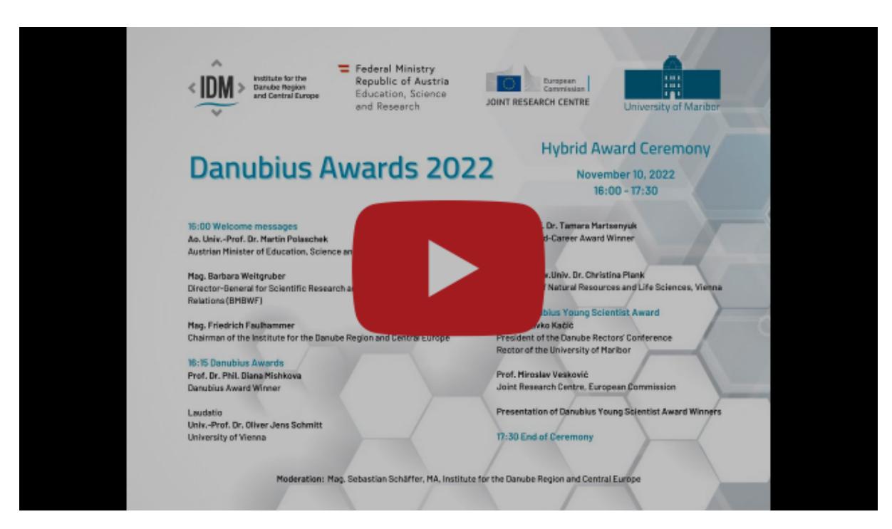
Watch the Danubius Awards 2022 Ceremony