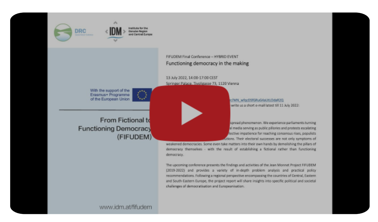
What the FIFUDEM Final Conference: "Functioning democracy in the making"

Some of the events that took place during the Project are: Kickoff Conference 2020, Young Scholars Forum 2020, Train the trainer seminar 2021/2022, DRC Annual Meeting 2021, IDM@GLOBSEC Bratislava Forum 2022, DRC Summer School 2022, Final Conference 2022, 5 Democracy Talks.