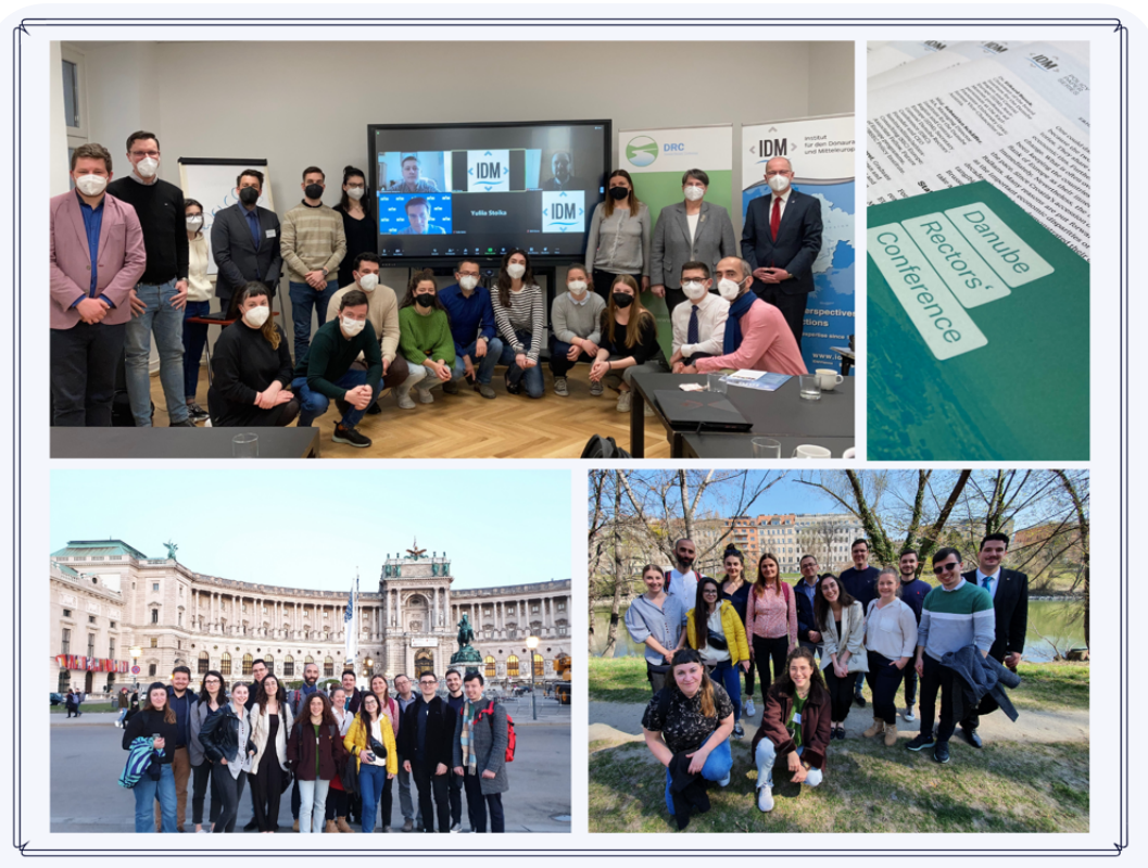
DRC Strategic Foresight Meeting - Vienna, 27-29 March 2022

We are pleased to share with you some details of the DRC Strategic Foresight Project's first meeting!